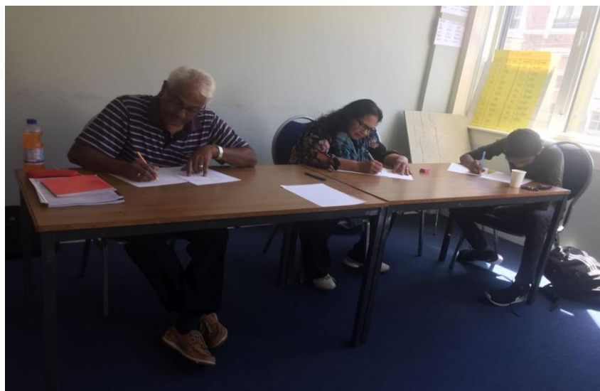
Hindi Students writing Level 3 exam at The Gandhi Centre

Hindi language has its origins in the ancient Indian language Sanskrit. It is widely used in both India and Suriname. Large number of students study this language at The Gandhi Centre.