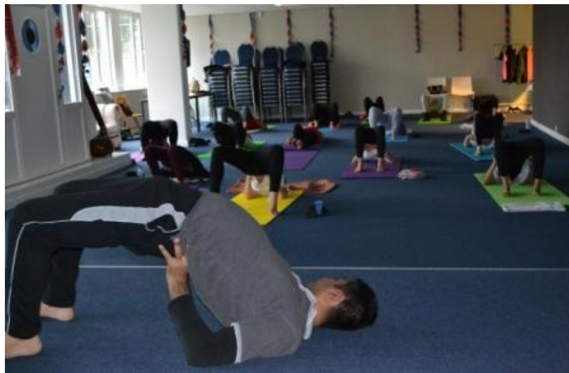
Yoga Class at The Gandhi Centre

Yoga is a science and art of healthy living with origins in ancient India. It is a stress management therapy and its practice increase immunity and contributes to overall physical and mental being.