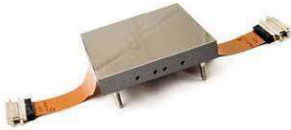
Fig1: 6k x 6k CCD, SiC buttable package with Flexi connector (pictorial representation)

This document outlines the specifications and requirements for the procurement of CCD Detector Controller Electronics. The electronics must be specifically designed to control a 6k x 6k CCD array specifically CCD-231-C6